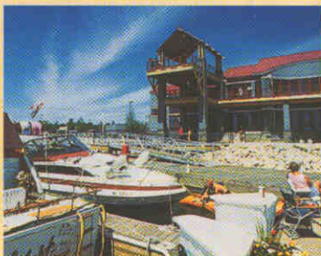
(Harbor Centre Marina)

building, boat launch ramps, a community center, youth boating center, a beach and beach house, picnic shelters, tennis courts, maritime theme playgrounds, and a scenic break-water promenade.